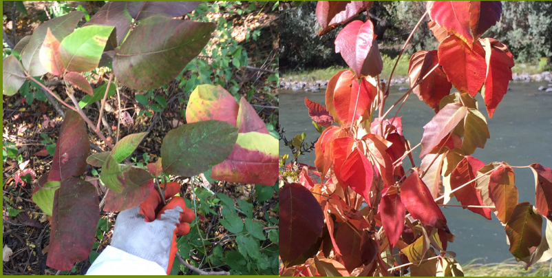
Eastern Poison Ivy

Poison ivy's fall colors are in full swing in many parts of the county. Poison ivy is usually one of the very first plants to have its leaves change color in the fall. You'll look out into the woods and everything will be green, except for the bright yellow, orange, or red leaves on a poison ivy vine or shrub.